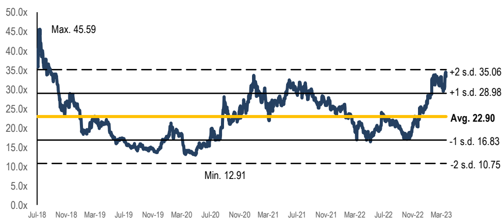
Figure 2: One year forward P/E of Xiaomi