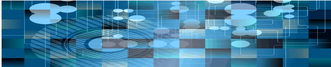
Chart of the week – What is the potential for online consumer finance in China?